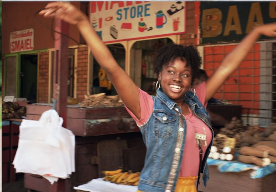
Clockwise: Hilda , March of the Penguins 2: The Next Step , Sing Song , Room 213

NEW YORK (January 17, 2018) – The Oscar® qualifying NY Int'l Children's Film Festival announces its complete 2018 feature lineup. Celebrating its 21st anniversary, the 2018 Festival presents four weekends