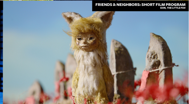
FRIENDS & NEIGHBORS: SHORT FILM PROGRAM GOA, THE LITTLE FOX