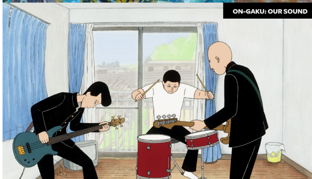
ON-GAKU: OUR SOUND